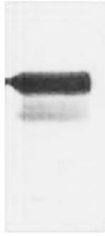
Fig. Western blot analysis of Recombinant AD protein using GAL4 Activation Domain Polyclonal Antibody. Secondary antibody (catalog#: A21020) was diluted at 1:20000.

Note: The product listed herein is for research use only and is not intended for use in human or clinical diagnosis. Suggested applications of our products are not recommendations to use our products in violation of any patent or as a license. We cannot be responsible for patent infringements or other violations that may occur with the use of this product.